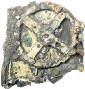
Antikythera Mechansim from our March Video Presentation